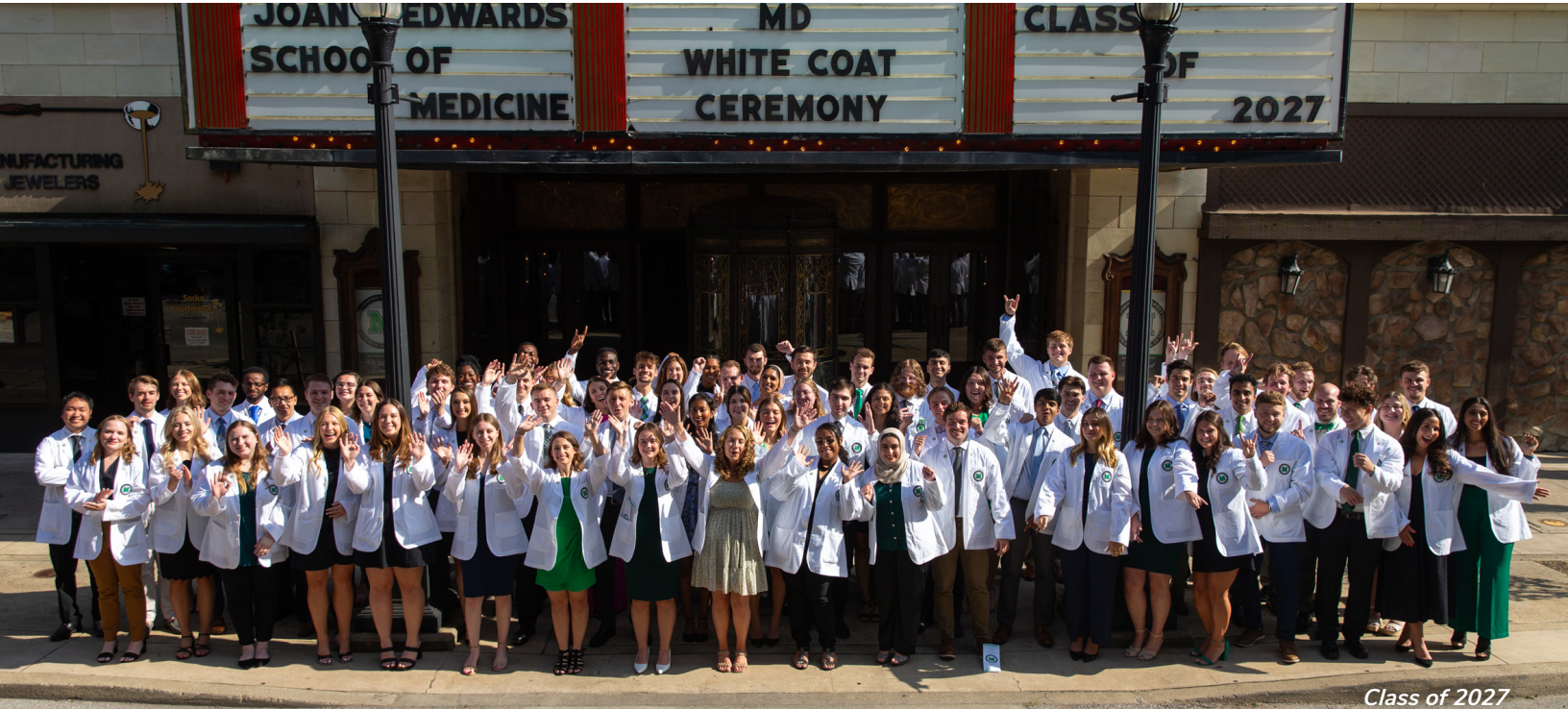
Class of 2027