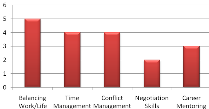
Sessions of Interest