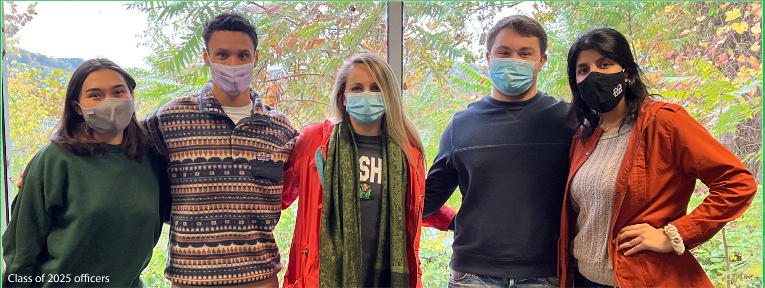
Class of 2025 officers